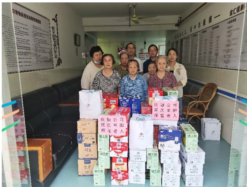
Nursing centre visit on the eve of National Day and Mid-Autumn Festival

During the Reporting Year, the Group organised visit to an elderly nursing centre on the eve of the National Day and Mid-Autumn Festival, along with warm greetings and food, and spent quality and tender time with the elderly. The Group was taking care of the elderly's needs, and donated pastries and milk to the nursing centre. During the Reporting Year, the Group engaged 2 volunteers, volunteered approximately 2 hours and donated approximately RMB3,000 in cash and supplies.