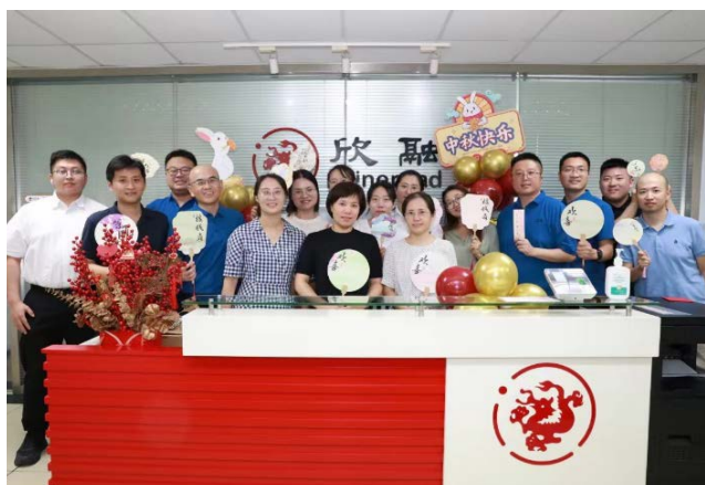
Mid-Autumn Festival Activities