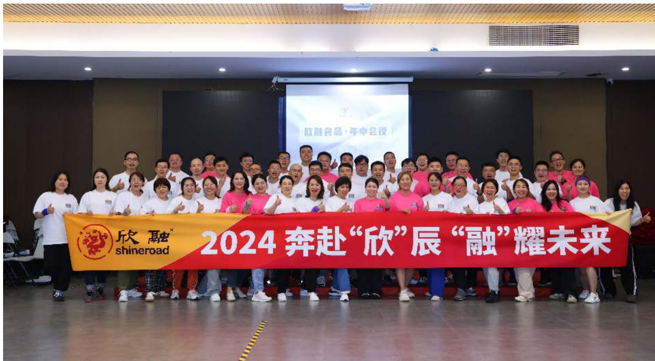
Mid-year Team Building Activity

To cultivate employees' sense of belonging to the Company, promote friendship among employees and build team spirit, the business units organised various activities regularly. Gifts and coupons were also given during the holiday seasons for employees to share with their families.